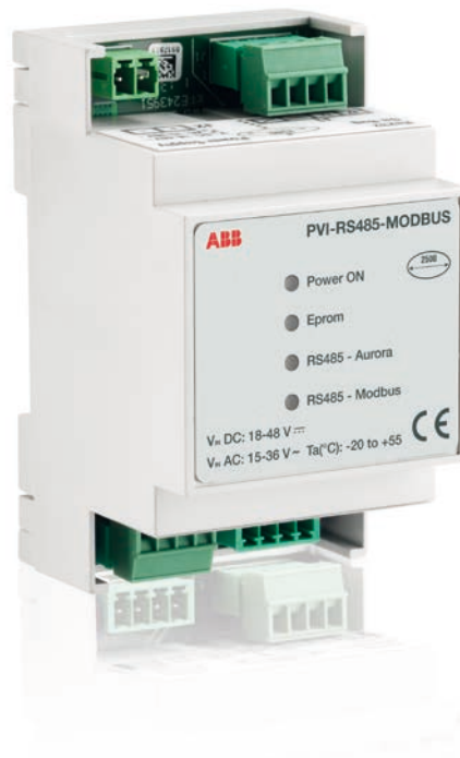
ABB monitoring and communications PVI-RS485-MODBUS Converter

PVI-RS485-MODBUS is the ABB devices family able to convert the proprietary Aurora Protocol to ModBus RTU or ModBus TCP communication protocol.