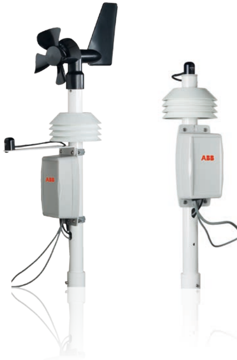
ABB monitoring and communications VSN800 Weather Station

The VSN800 Weather Station automatically monitors site meteorological conditions and photovoltaic panel temperature in real-time, transmitting sensor measurements to the Aurora Vision® Plant Management Platform.