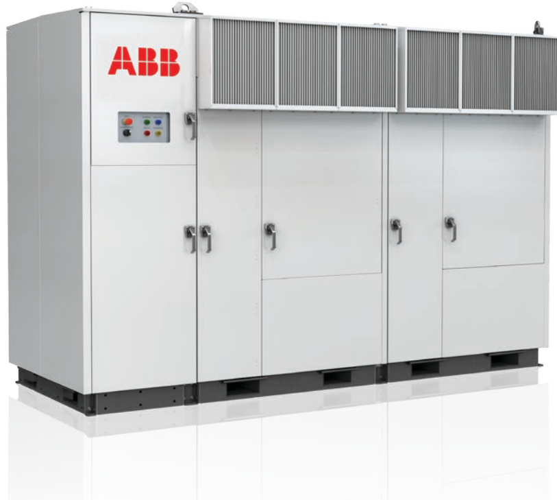
ABB central inverters raise reliability, efficiency and ease of installation to new levels. The inverters are aimed at system integrators and end users who require high-performance solar inverters for large photovoltaic (PV) power plants. PVS980 central inverters are available from 1818 kVA up to 2000 kVA, and are optimized for cost-effective, multi-megawatt power plants.