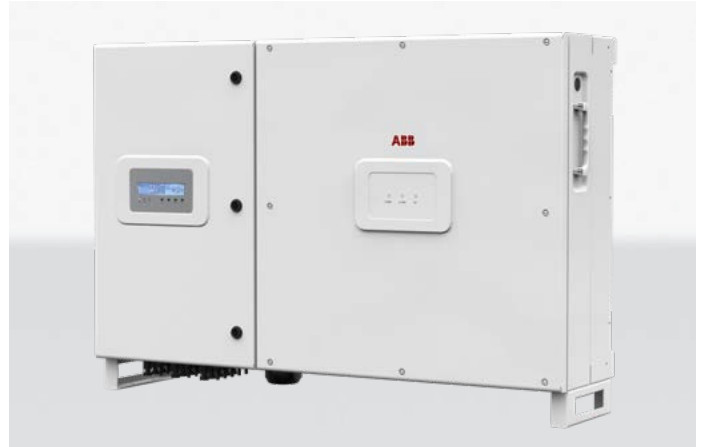
ABB string inverters PVS-50/60-TL